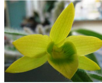
Uncommon Plant Den. senile