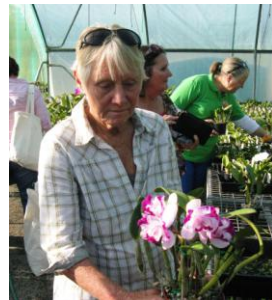
Some photos from August meeting