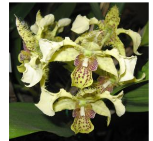
Den. macrophyllum X Den. polysema