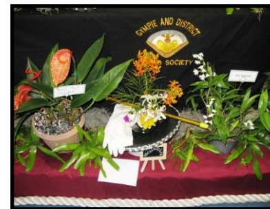
Theme Magic of Orchids