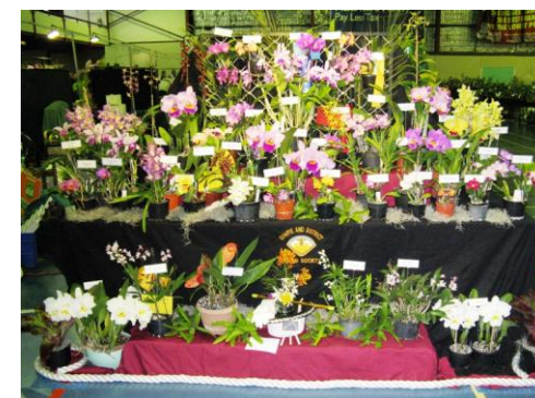
Gympie Display At Hervey Bay