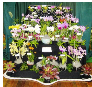
Gympie Display At Glasshouse