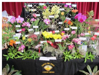
Gympie Display At Maryborough