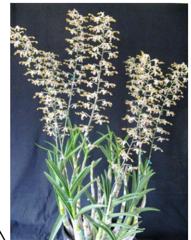
Den. Rosy Curls 'Mavblue Rebecca'