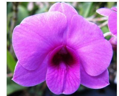
Den. bigibbum 'Alan'