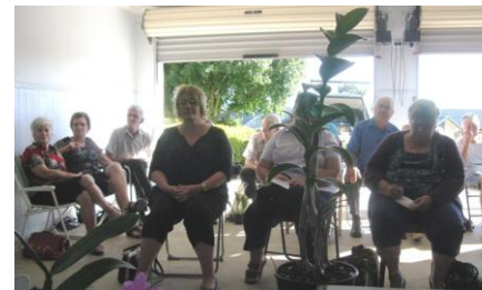
A few of our members