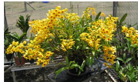
Den. chrysotoxum var. suavissimum Another nice specimen